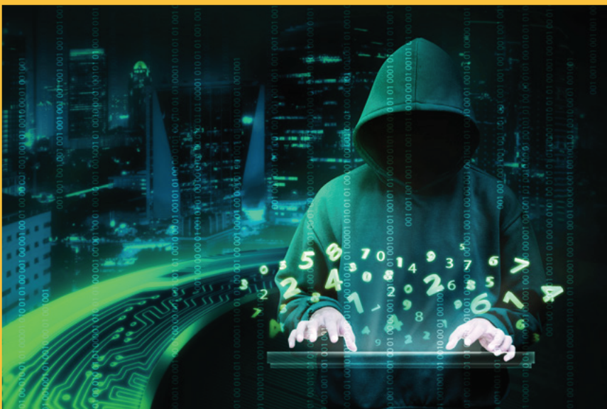
Figure 1: What is cyber security?

According to the UK National Cyber Security Centre , cyber security is how individuals and organisations reduce the risk of cyber attack.